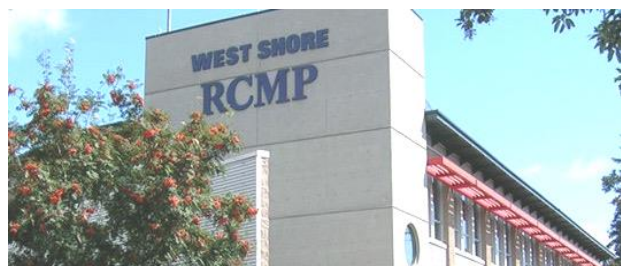
DISTRICT OF HIGHLANDS